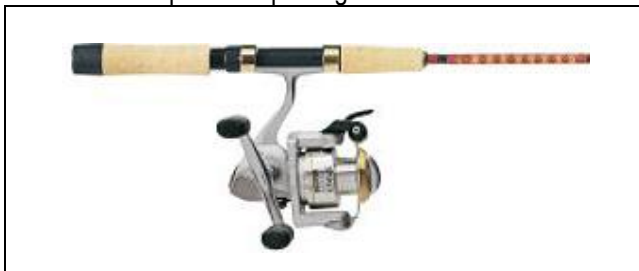
Example of a Spinning Rod & Reel