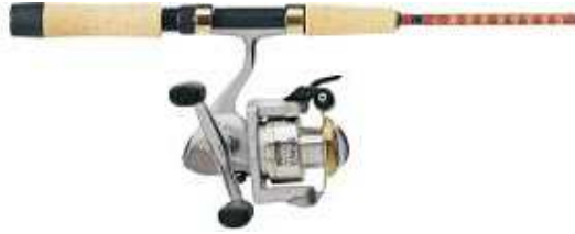
Example of a Spinning Rod & Reel